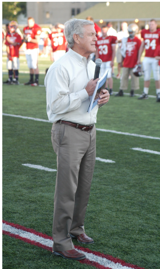
CCSHall of Fame member Dick Vermeil at 2008 Valor Bowl.

CCSHOF P. O. Box 30 West Chester, PA 19381-0030