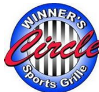
Winner's Circle Exton location is the new home of CCSHoF memorabilia

For more information about the Winner's Circle restaurants, visit them on the web at winnerscirclesports-grille.com or at the Exton or Newtown Square locations.